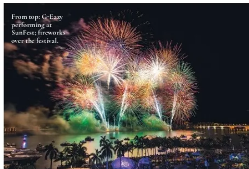
From top: G-Eazy performing at SunFest; fireworks over the festival.