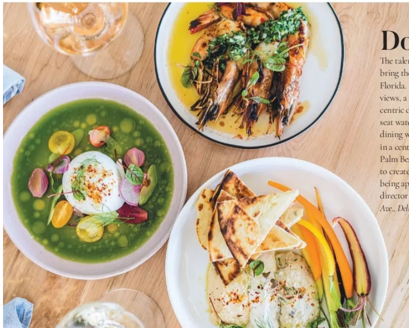
Meso Beach House's charred prawns, mezze and burrata